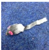
Hickory Dickory Dock