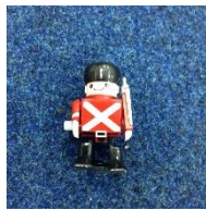
The Grand Old Duke of York