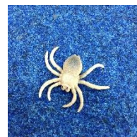
Incey Wincey Spider